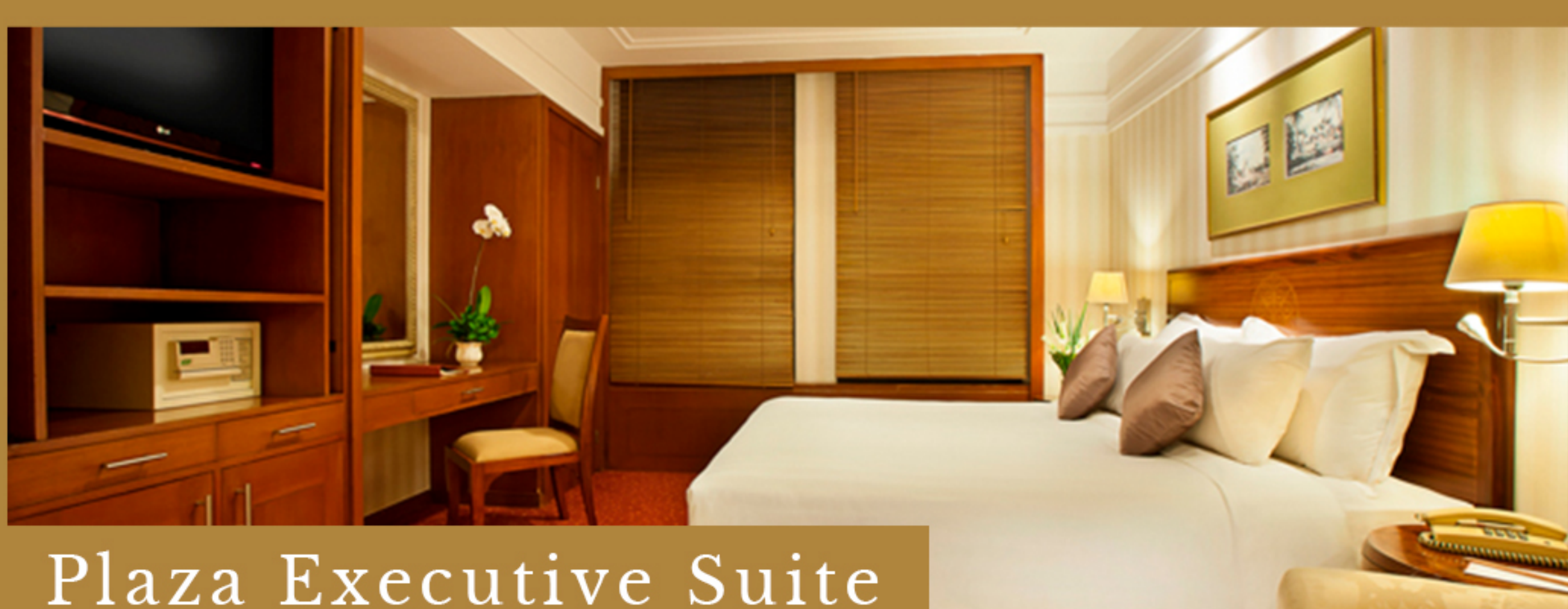
Plaza Executive Suite