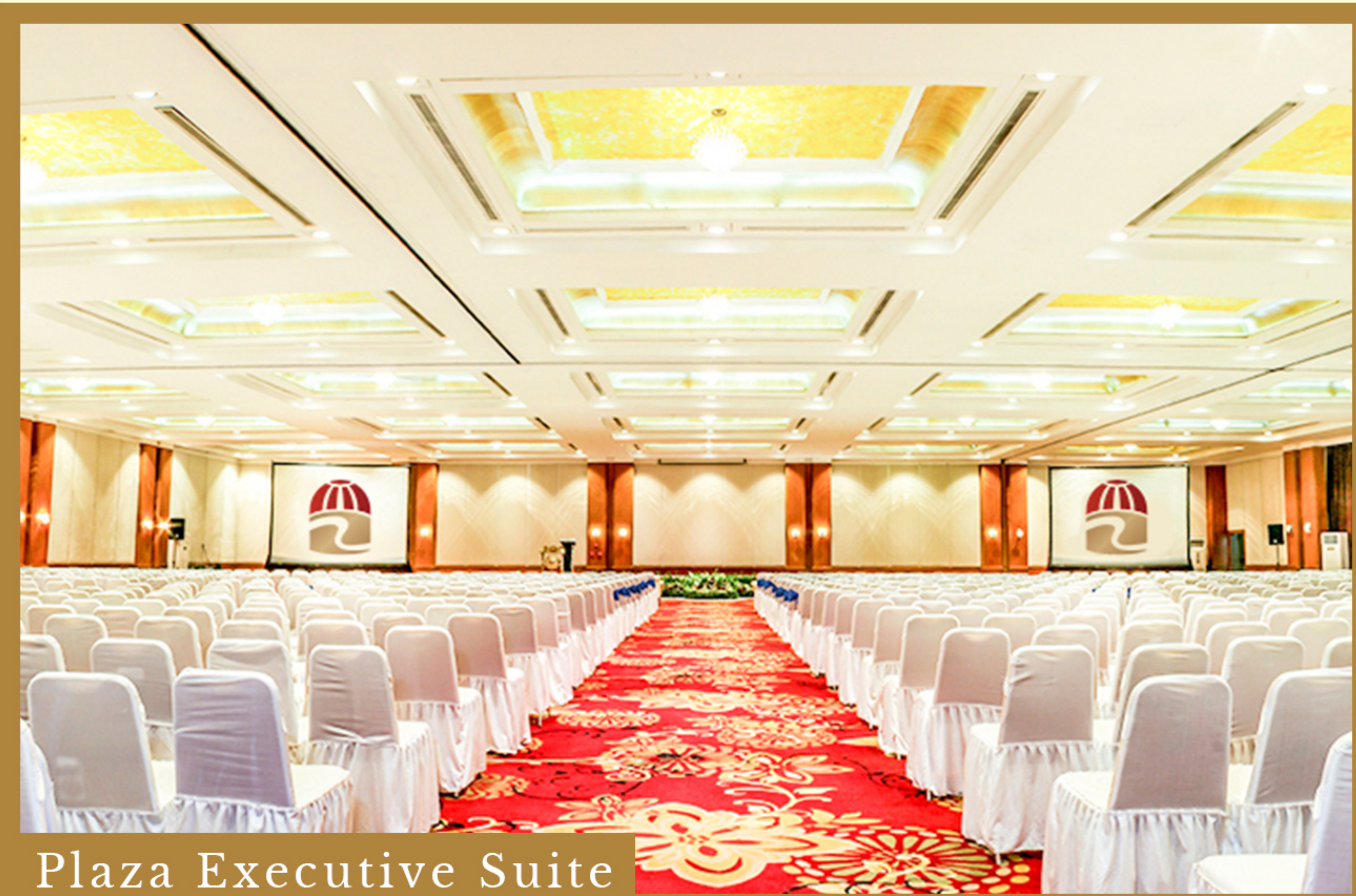
Plaza Executive Suite