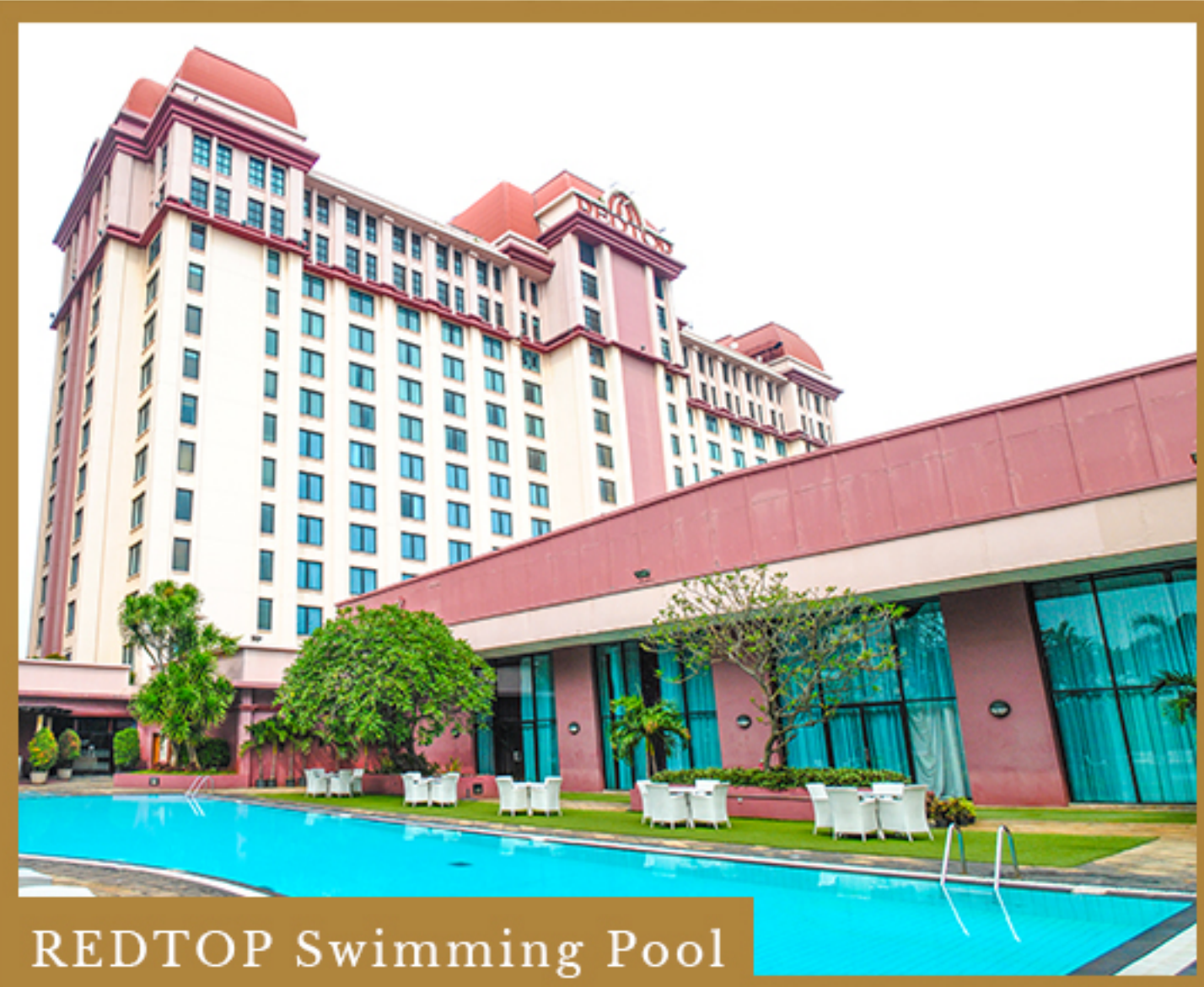
REDTOP Swimming Pool