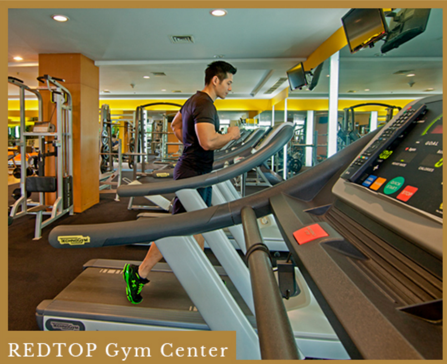
REDTOP Gym Center