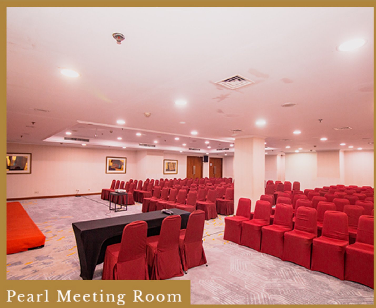
Pearl Meeting Room